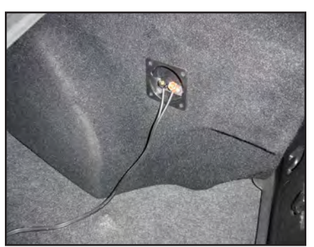
STEP 4 Place the Stealthbox® into the trunk. Run speaker wire to the Stealthbox® and wire to the terminal. Double check the woofer for proper operation.