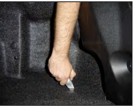
Lay the trunk flooring back into the corner. Feel for the hole exposed in STEP 2 and cut the flooring at the hole.