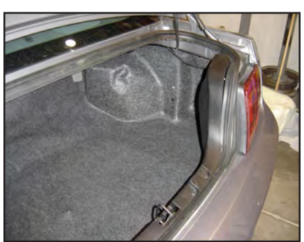
STEP 1 Remove any contents from the trunk.