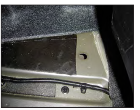
S T E P 2 Flip up the passenger's side corner of the trunk flooring and remove the exposed a black rubber grommet.