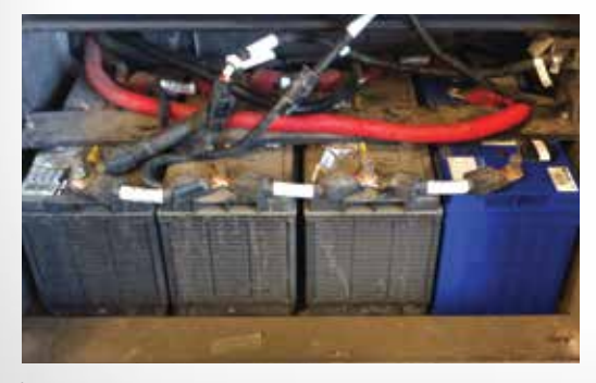
†See user manual for full installation details